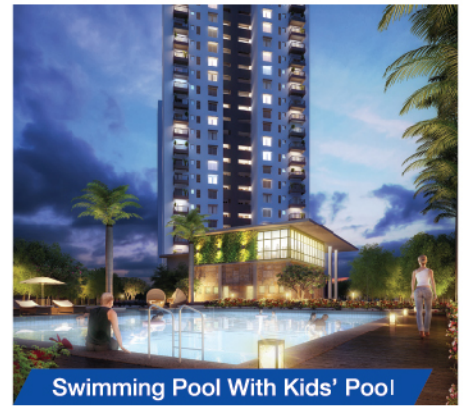
Swimming Pool With Kids' Pool