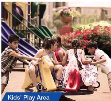
Kids' Play Area